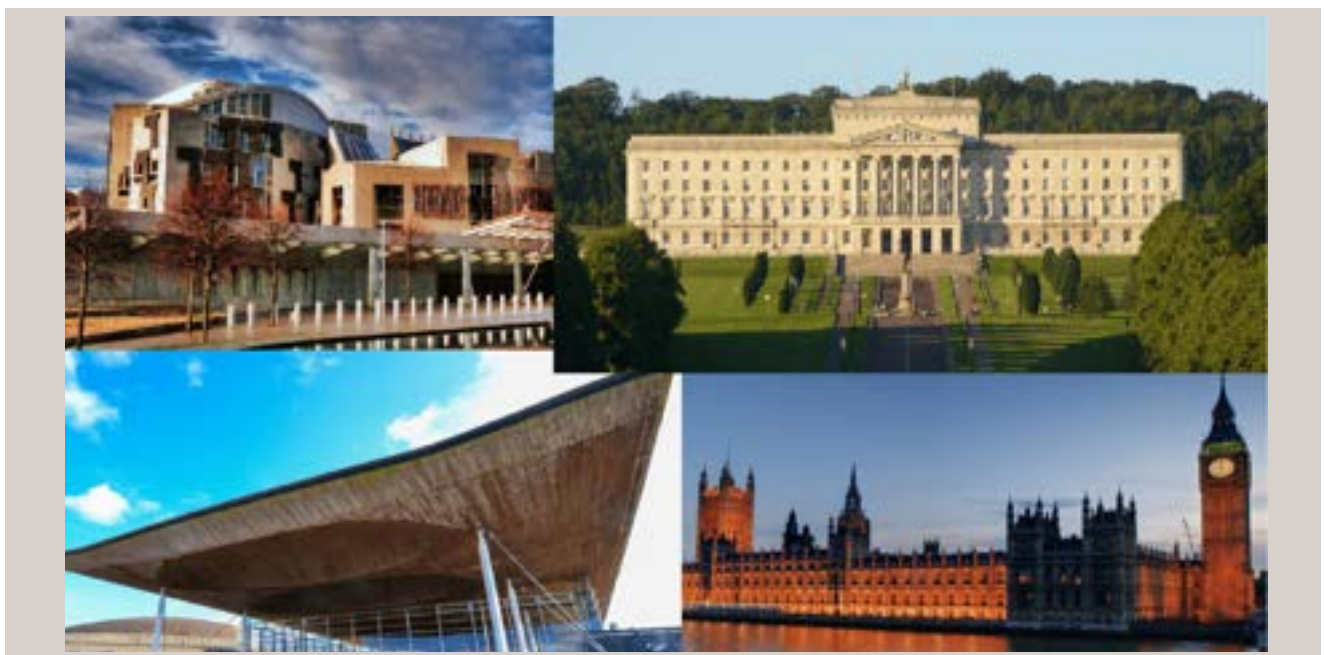
Scottish Parliament, Edinburgh (top left), Northern Ireland Assembly, Belfast (top right), Senedd Cymru, Cardiff (bottom left), Houses of Parliament, London (bottom right)