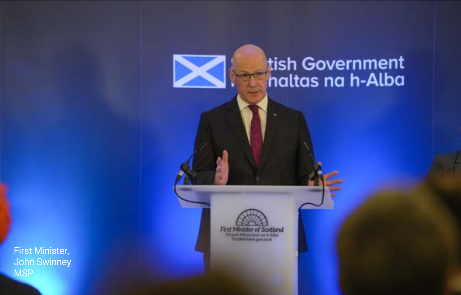
First Minister, John Swinney MSP