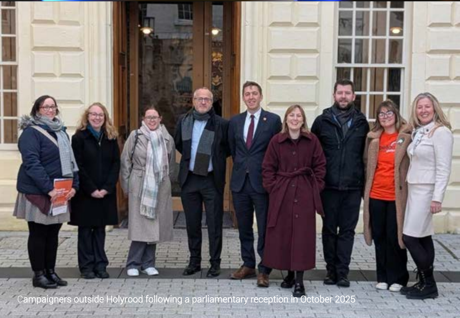
Campaigners outside Holyrood following a parliamentary reception in October 2025